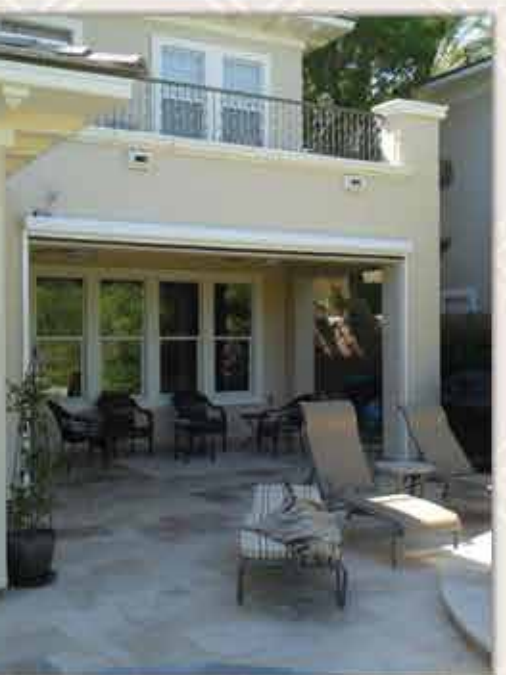
Open roller shade