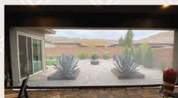
View from inside