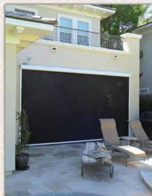
Closed roller shade