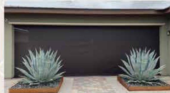
View from outside